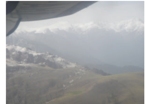
The Great Himalayas - Tibet Border