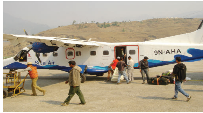
Twelve seat mountain jumper

We were told that the Maoist would let a tourist taxi pick us up half way. Road blocks were every 100 yards with hundreds and thousands of young angry Maoist. There was supernatural protection on us as we walked (with our bags) through them. We were told that they were mad at the Government and not us???????? We finally flew out to Amsterdam where we were greeted with a new eruption of the volcano in Iceland. In all, it took 43 hours to get home - but we made it - Thanks to your prayers and