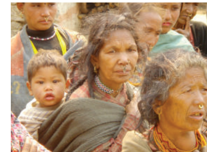
Tibetan Buddhist Listening to the Gospel