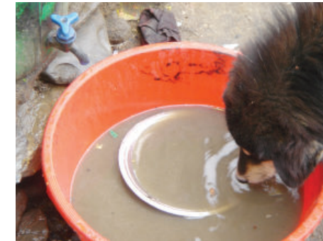
Nepal Restaurant Dishwasher "Notice the dishes and the color of the water!"

"Heal the Sick, Cleanse the Leper, Raise the Dead, Cast out Devils"