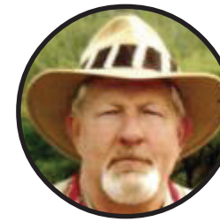
Dub Lewis www.dublewis.net