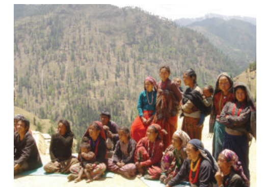
Preaching at over 9000 feet